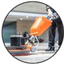
CLEANING & MAINTENANCE