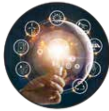
ENERGY EFFICIENCY & SUSTAINABILITY